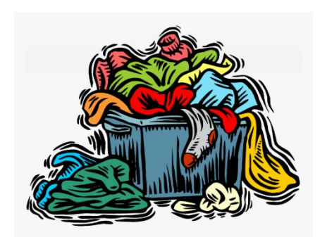
Dates for your Diary

Please make sure that all clothing items are clearly labelled with your child's name. If your child does lose an item of clothing, please ask reception if you check lost property which is located near the big hall.